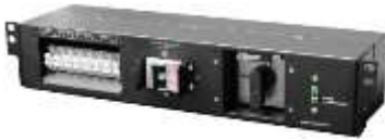
MBS 6/10kVA (Maintenance Bypass Switch) Datasheet: Item No.: 10120584