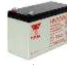
Yuasa 12V/9Ah battery Datasheet: Link CSB or Panasonic brand can also be used