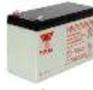
Yuasa 12V/7Ah battery Datasheet: Link CSB or Panasonic brand can also be used