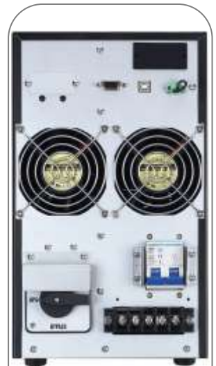
Intelligent Slot, RS-232, USB, EPO, MBS, Terminal